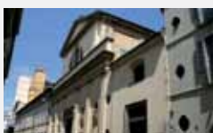
Chiesa di Sant'Antonio Abate Via Sant'Antonio 5