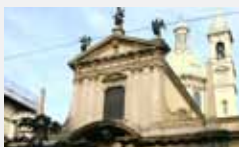
Basilica di San Giorgio al Palazzo Piazza San Giorgio, 2