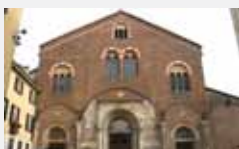
Chiesa di San Smpliciano Piazza San Smpliciano, 7