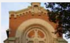
Chiesa del Sacro Cuore di Gesù Viale Piave, 2