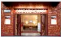
Auditorium di Milano Fondazione Cariplo Largo Mahler