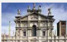
Santuario di S. Maria dei Miracoli presso San Celso Corso Italia, 37