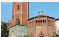
Chiesa di San Gottardo in Corte al Palazzo Reale Via Francesco Pecorari, 2