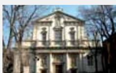
Chiesa di Sant' Angelo Piazza Sant'Angelo, 2