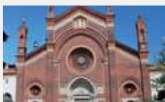
Chiesa di Santa Maria del Carmine Piazza del Carmine, 2