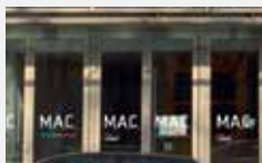
M.A.C. Musica, Arte, Cultura Piazza Tito Lucrezio Caro, 1