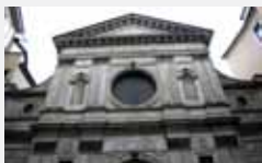
Basilica di Santa Maria presso San Satiro Via Torino, 17-19