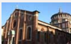
Chiesa di San Marco Piazza San Marco, 2